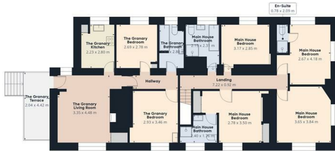
Floor 0 Building 5